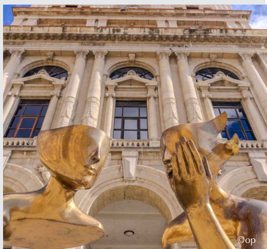
Plaza Vieja, Havana