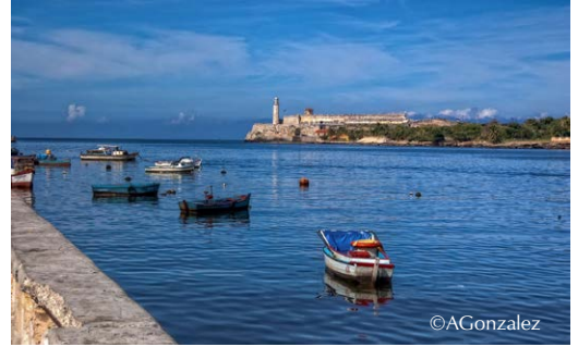
Sea wall and harbor in Havana