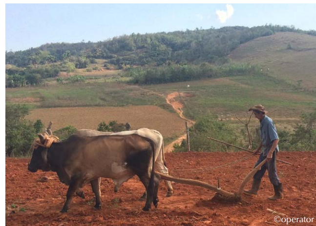
Finca Marta, an agroecological farm

This morning we depart Havana and begin our journey to Viñales, with a scenic drive through the western province of Pinar del Rio, a UNESCO World Heritage Site and a pine-populated, red-soiled, tobacco-growing region of Cuba. We stop along the way at Las Terrazas, a unique eco-community. Meet the locals as they welcome us to their community and learn about their lifestyle, its artistic heritage, and its reforestation efforts. Next, we take a guided hike through the verdant forests, providing stunning views of the surrounding landscapes. End our tour with a hearty, locally sourced lunch at a paladar. Afterward, we visit Finca Paco y Concha, a 3 rd -generation tobacco farm, and learn about the process of creating the world's finest tobacco. We continue driving to Viñales, where we check-in to our bed-and-breakfast villas—rooms in country homes in the center of town. Dinner this evening is with our host families. Afterward, we have the option to gather with locals and visitors alike to dance and listen to Cuban rhythms. Two nights at family-run bed-and-breakfast country homes. (B,L,D)