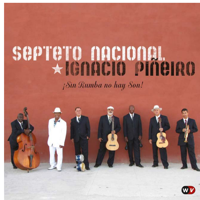
Attend a private concert by El Septeto Nacional in Havana