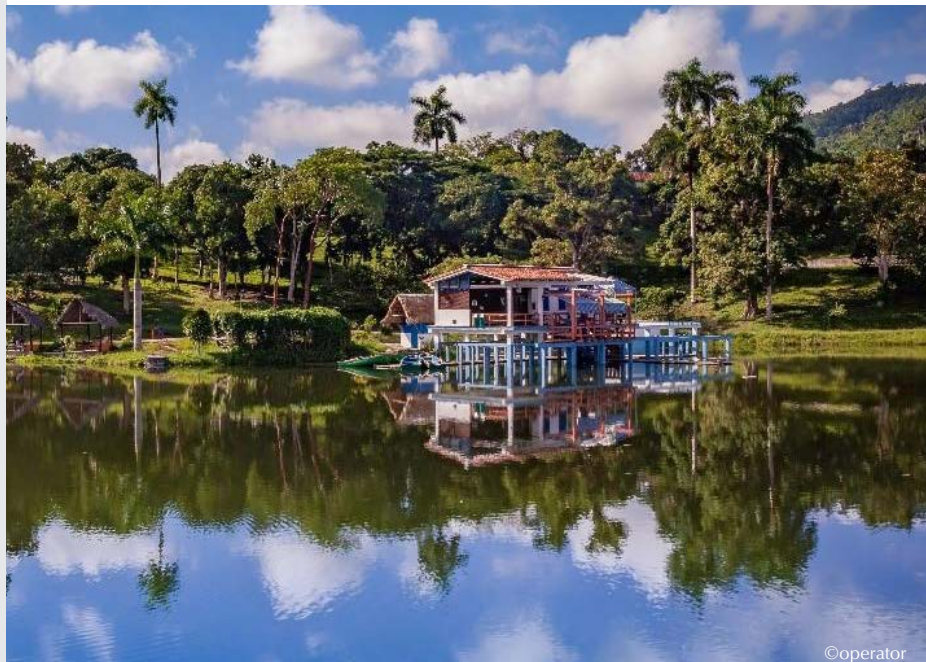
Las Terrazas eco-community

At the time we visit we can expect generally sunny weather, with an increase in summer heat during the day and pleasant evenings. Average daytime temperatures will be in the mid- to high 80s F, perhaps even touching the low 90s, and nighttime temperatures will be in the low 70s F. The humidity in this region can be high and the sun is strong, so lightweight layers and plenty of sun protection is recommended. There is always a chance of pop-up showers and participants should be prepared. Complete pre-departure details will be sent to participants.