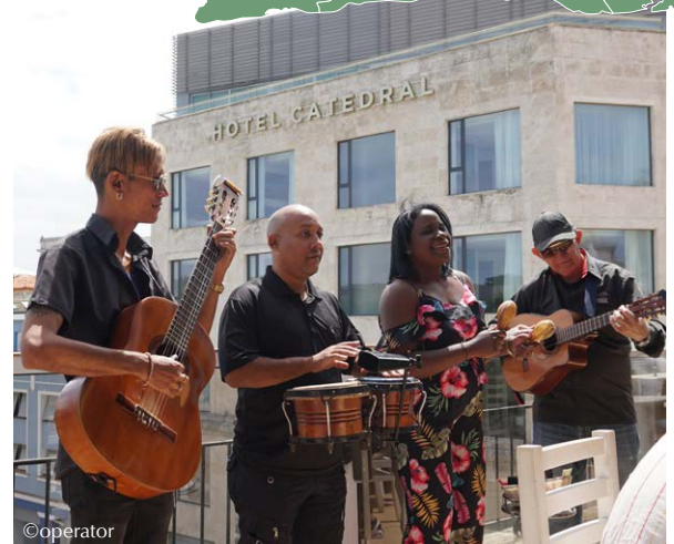
Musicians in Havana