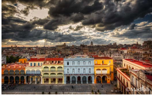
Plaza Vieja, Havana