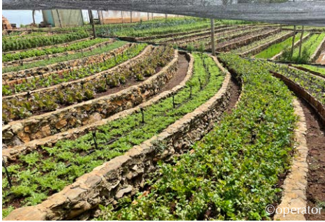
Finca Marta, an agroecological farm