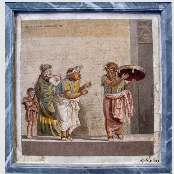
Mosaic at the Naples Archaeological Museum