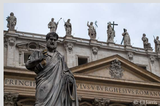
St. Peter's Square (Rome)

Today we add a Baroque overlay to ancient and Renaissance Rome. Begin in Piazza Navona, once a chariot racing track, now a gathering place centered around Bernini's Four Rivers fountain. Walk by Palazzo Madama, a palace built for the Medicis in the High Renaissance, which currently houses the Senate of the Italian Republic. Continue to the Church of San Luigi dei Francesi to see Caravaggio's cycle of paintings depicting the life of Saint Matthew. Pass by