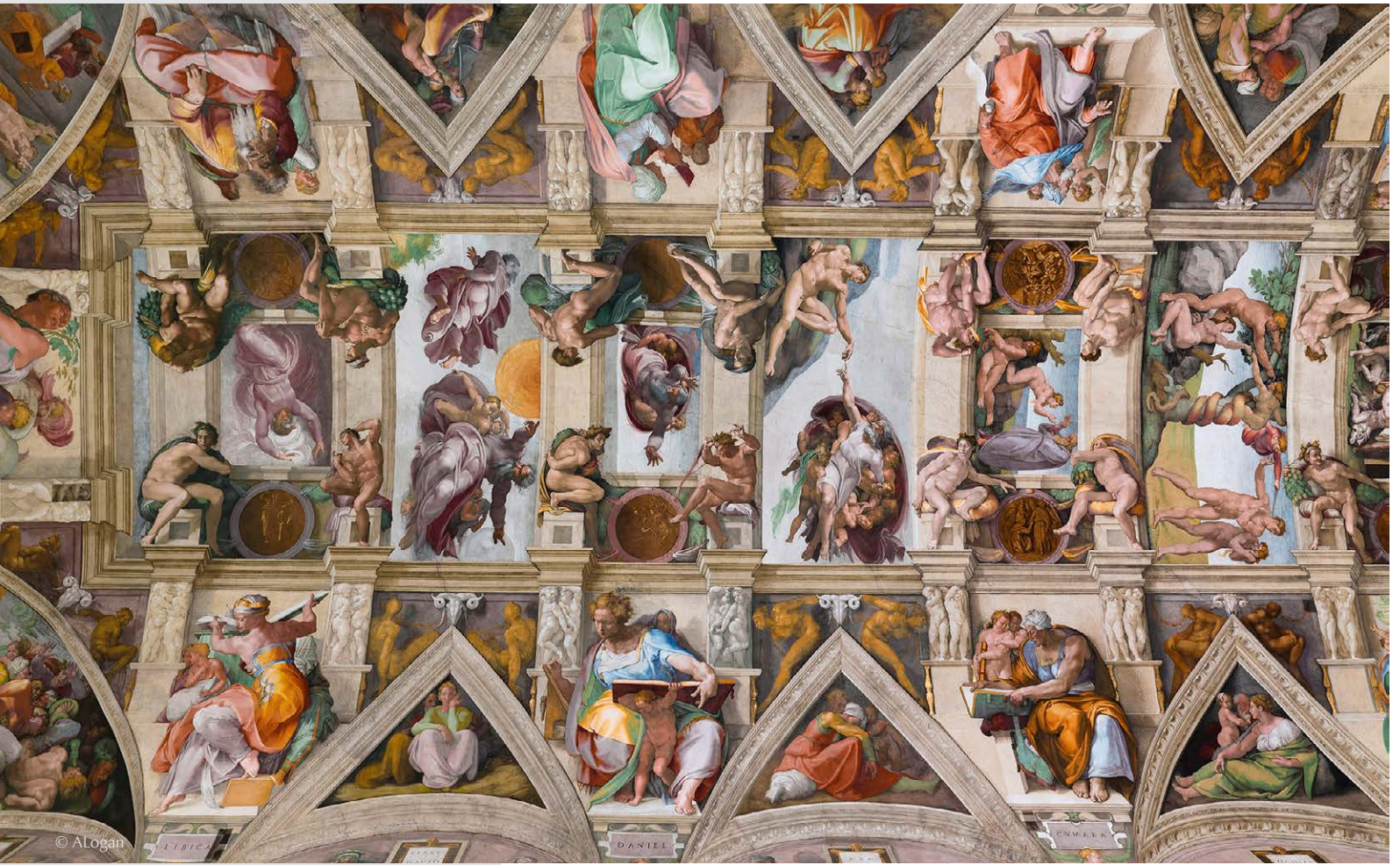
Michelangelo's magnificent and restored ceiling in the Sistine Chapel.