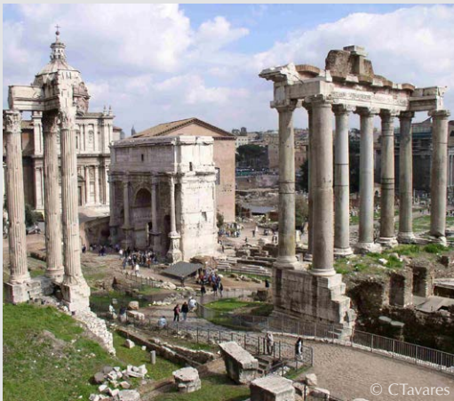
The Roman Forum