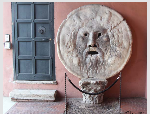
La Bocca della Verità, the "mouth of truth," inside the Basilica of Santa Maria in Cosmedin (Rome)