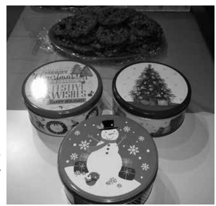
(right) This year, WES scholars took their cookies home in festive tins.