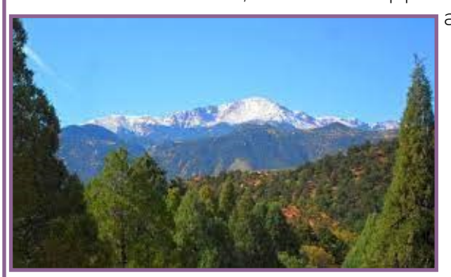
Pikes Peak; 14,111 feet