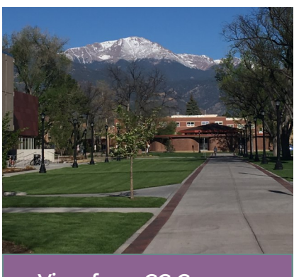
View from CC Campus

Colorado Springs is close to the mountains so the weather can change at a