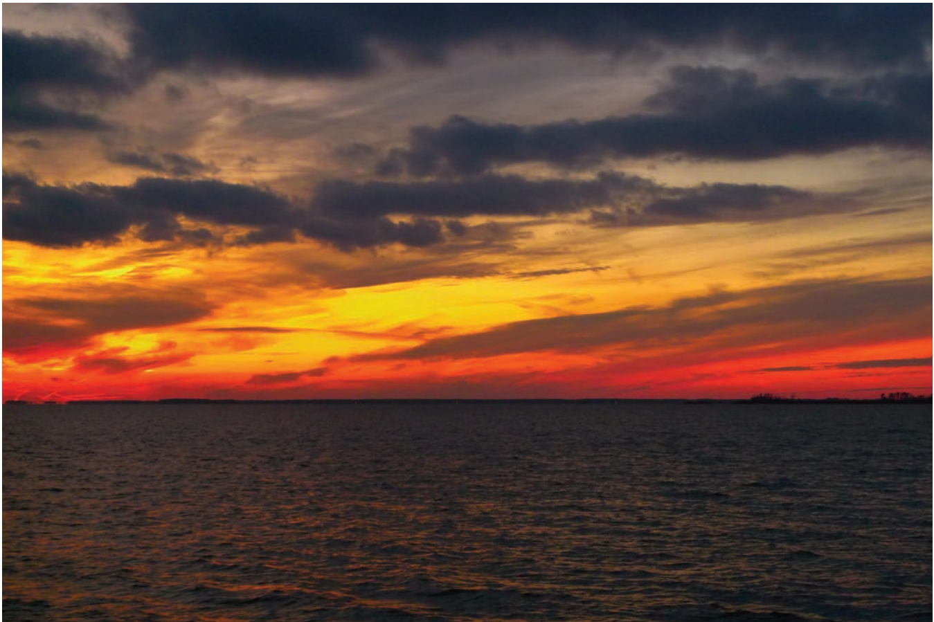
"Sunset – Eastern Bay 7" by Nora Lives – (own work). Licensed under Creative Commons Attribution-Share Alike 3.0 via Wikimedia Commons – http://commons.wikimedia.org/wiki/File:Sunset_-_Eastern_Bay_7.jpg#mediaviewer/File:Sunset_-_Eastern_Bay_7.jpg