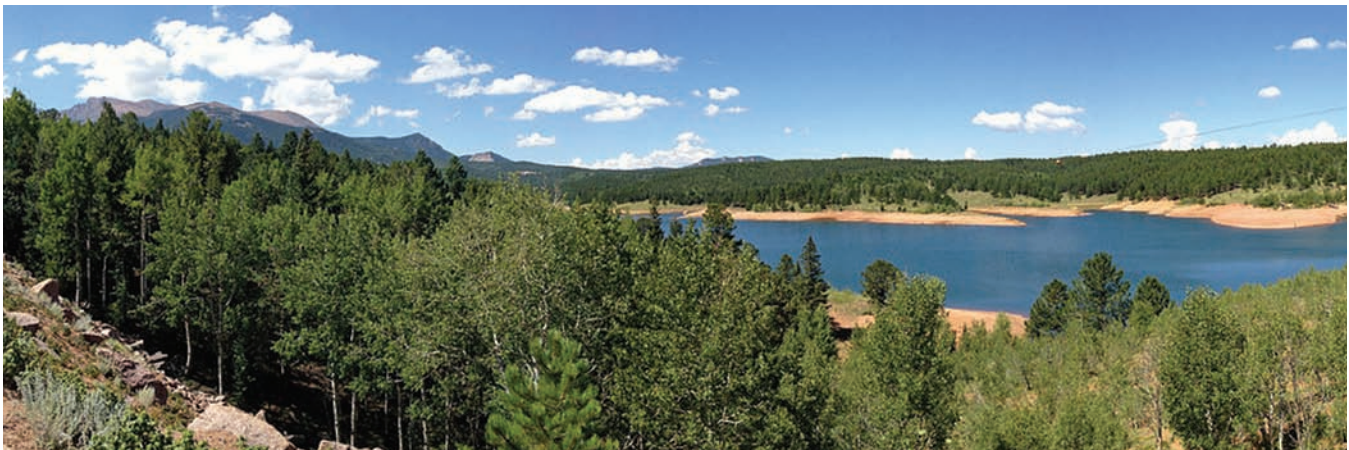
"Crystal Creek Reservoir 1" by Fredlyfish4 – own work. Licensed under Creative Commons Attribution-Share Alike 3.0 via Wikimedia Commons – http://commons.wikimedia.org/wiki/File:Crystal_Creek_Reservoir_1.JPG#mediaviewer/File:Crystal_Creek_Reservoir_1.JPG