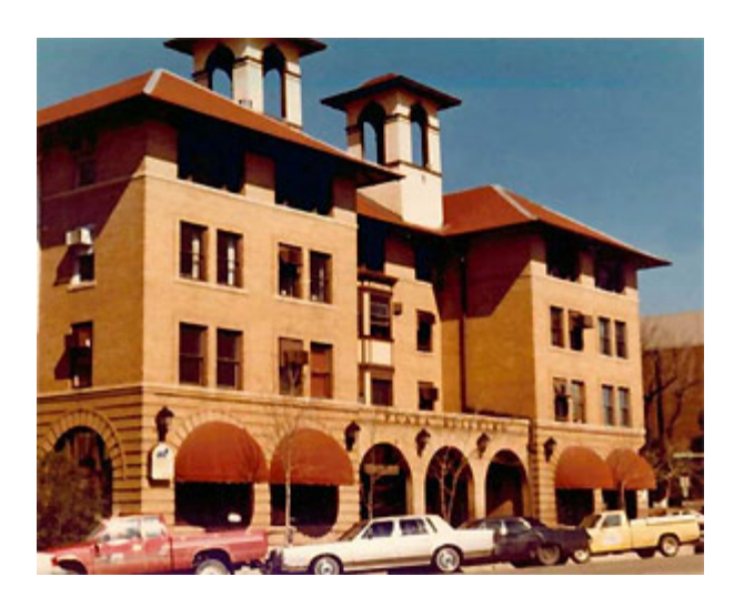
15. PLAZA HOTEL (SPENCER CENTER) 830 N. Tejon St., Colorado College Campus National Register 09/01/1983, 5EP.331

Built in 1901, the hotel is a four story, H-plan structure of cream-colored pressed brick. It is <u>Renaissance Revival</u> in its overall massing, while Spanish influences are evident in its detailing. Listed under <u>Historic Resources Colorado College</u> Thematic Resource.