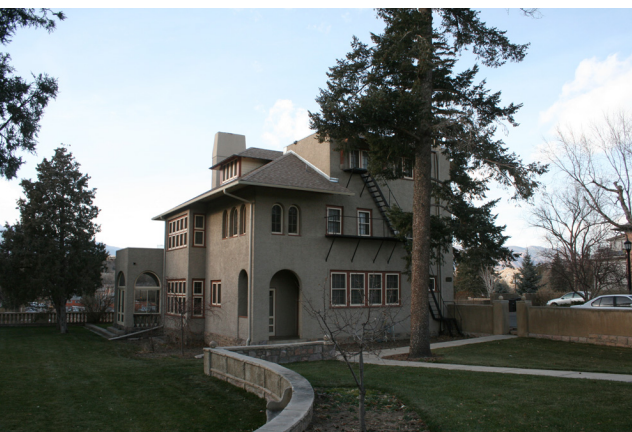
The 1916 Dodge-Hamlin House is an excellent local representation of the <u>Mission</u> architectural style and its surrounding grounds are an intact residential landscape reflecting City Beautiful concepts. Both the house and gardens are the work of master architect Nicolaas van den Arend.

In addition to its significance for architecture and landscape architecture, the property is significant in the field of Education, as specified in the Multiple Property Documentation Form (MPDF) <u>Historic</u> <u>Resources of Colorado College, Colorado Springs, Colorado</u> for its association with the growth of the Colorado College campus and its educational programs (1943-64).