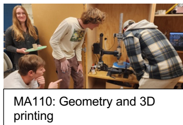
MA110: Geometry and 3D printing