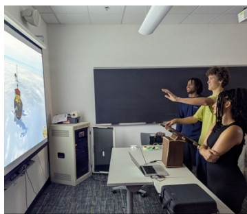
CP341: Experience Design in Ubiquitous Computing