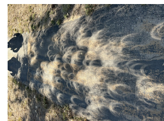
October 14 Eclipse over NM.