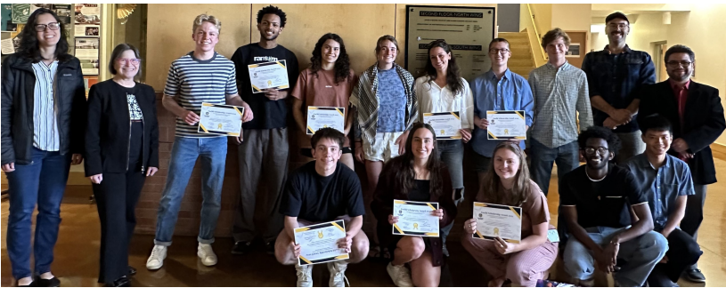
2024 Euclid Scholars and CC faculty.

The Euclid scholarship recognizes the outstanding potential and passion for Mathematics, Statistics, or Computer Science among first and second-year students. This year, our department received 60 nominations and awarded 15 scholarships, made possible by the generous contributions of alumni and friends. Selections were made based on rigorous evaluations by faculty members and the compelling narratives within students’ essays, which described the roles these disciplines play in their lives and how they envision that role evolving over the next few years. Nominated students demonstrated exceptional talent, a strong commitment to learning, and a deep appreciation for at least one of these disciplines.