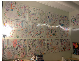
Blockly Doodle Sheets Honor Wall.